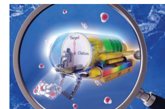
Figure 3. Conceptual figure of a chemical sensor for cross-scale analysis.

Based on fusion technologies of nano electrochemistry, molecular recognition chemistry, and microfluidics, this project attempts to establish fundamental analytical methods for multi-analyte detection. We believe that the technologies and methodologies established in this project will be further applied to water cycle analysis.