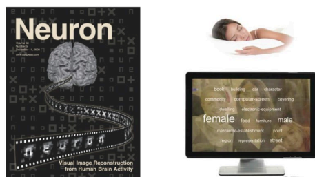
Figure 1 Neural decoding of visual information

In this project, we collect brain activity data using functional MRI (fMRI) while participants are seeing images (Perception), having mental imagery (Imagery), or having dreams (Dreaming) (Figure 2). In addition to decoding analyses within each dataset, we perform generalization analyses in which a decoder trained on a dataset is tested on another dataset. Using the generalization