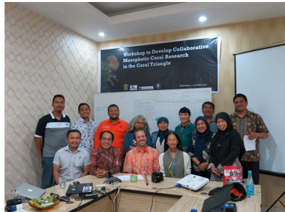
Speakers at the 1st Workshop to develop collaborative mesophotic research in the Coral Triangle.

The first year of this project was mainly focused on the Indonesian part of the Coral Triangle and the formalization of the collaboration agreements. During this first year of the project, an international workshop was organized in Makassar, Sulawesi, Indonesia with collaborators from the University of the Ryukyus (Japan), the Hasanuddin University (Indonesia), the Institut Perenthian Bogor (Indonesia) and from the Marine Science Institute (Philippines).