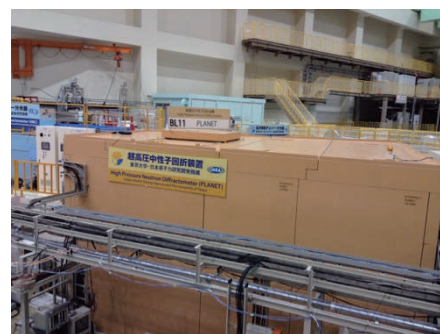
Figure 2 BL-11 at MLF, J-PARC.

Main experimental method in this research project is neutron diffraction measurements at high pressure at the PLANET beamline (BL-11), MLF, J-PARC (see Figure 2). The PLANET beamline was constructed by a research consortium led by members in this research project. Crystal structures of the materials in the deep earth and planets will be solved from X-ray diffraction measurements at PF, KEK and local structure surrounding hydrogen atoms will be obtained from neutron diffraction measurements at MLF, J-PARC. In this research, laboratory-based instruments will be also installed to support the measurements at