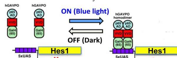
Fig. 2: Optogenetic Hes1 -inducible system.

(3) The significance of out-of-phase oscillations between neighboring NSCs: To elucidate the significance of out-of-phase oscillations, using mouse ES cells carrying the Hes1 light-inducible system (Fig. 2), we will generate brain organoid under pulsatile blue light illumination to induce in-phase Hes1 oscillations. We will examine whether this treatment affects the diversity of neurons.