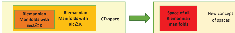
Figure 1. Image of behind of research