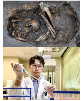
Figure 2. Image of the analysis of excavated human bones

Through this research, we will nurture the next generation of outstanding human resources who can transcend the boundaries of the humanities and sciences to play an active role on an international level. In addition, we conduct various field schools and seminars to train researchers who can handle hybrid research.