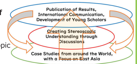
Figure 3. Circulation and Virtuous of Circle of Research Results