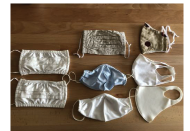
Figure 4. Masks as Connecting and Dividing Devices