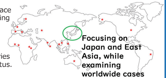
Figure 2. Research Regions

The severity of the pandemic's impact varies according to class, gender, and health status. We will reveal the reality of structural violence and explore the possibilities of solidarity that overcome disparities.