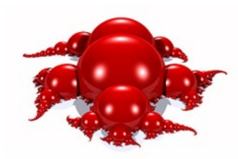
The convex hull of a Kleinian group