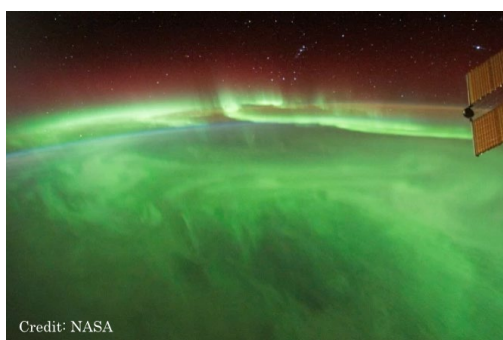
Figure1. Pulsating aurora viewed from International Space Station

The purpose of the project is to elucidate the ultimate production mechanisms of the pulsating aurora (PsA, Fig. 1). The pulsating aurora is one of the most fundamental auroras that rapidly switches on and off and/or modulates its luminosity quasi-periodically (typically 5s to 40s). It inherently involves an intermittent internal modulation with a few hundred msec apart, which modulation is believed to be the fundamental element of PsA without scientific demonstration yet. The project will have comprehensive means to pursue the purpose. Observations with extremely high time resolutions for all instruments will be realized in this study, and comparative studies between the observations and their complementary simulation shed light on the cause, possibly a plasma wave-high energy electron interaction and its consequence, PsA.