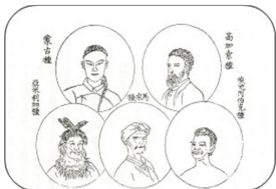
Blumenbach’s influence on Meiji textbooks (Takezawa 2015)