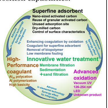
Fig. 1 Research plan.

start We with examining elemental technology of adsorption, coagulation and oxidation, and develop prototype materials and equipment and then apply a variety assessment methods, direct including