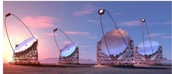
Figure 2: Artist view of the array of CTA Large Size Telescopes. Construction and operation will be realized one by one, and full operation will start in FY 2019.

Universe with high energy gamma rays up to a redshift of z < 4 . It will bring us extremely important insights into AGNs and GRBs. Furthermore, the search for the dark matter in the dwarf spheroidal galaxies and the Galactic Center is another important subject.