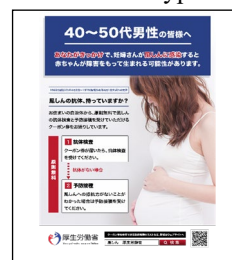
Figure 2 Use of effective nudge messages

economic experiments. To effectively nudge people, both how people make decisions in specific situations and their biases toward different decision-making processes must be understood, and then behavioral economics-based interventions that can correct these biases should be examined subsequently. In this study, we aim to verify the effectiveness of the identified interventions. The academic uniqueness of this study is that it involves personnel working on the frontlines of every target field. Specifically, participants include hospital doctors and nurses for healthcare, personnel from a disaster prevention division of a local government (Hiroshima Prefecture) for disaster prevention, researchers at the National Research Institute