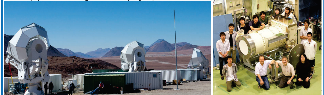
Figure 2. Pictures of the instruments (Left: Simons Array telescopes, Right: POLARBEAR-2 detector system.)

The instruments in this study are the Simons Array telescope in Atacama, Chile, and the POLARBEAR-2 detector system mounted on it. The Simons Array telescope is a "big but quick" telescope with a primary mirror with an effective diameter of 2.5 meters. It is a unique instrument that allows simultaneous exploration of accelerations in the early universe and the present. The POLARBEAR-2 detector system was developed under the leadership of this study's PI with support from the 2015-2019 Scientific Transformation Area (A) "Accelerating Universe" project, and observations started in 2019.