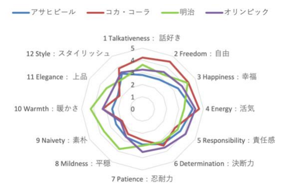
Figure 3: Polar chart displaying mean values of 12 factors of Asahi Breweries, Coca-Cola, Meiji and Tokyo 2020

(2) In 2019 I supervised one student researching about brands in non-alcoholic beverages, dairy and confectionery categories. An online questionnaire was conducted about the brand and logo personality of Asahi Breweries, Coca-Cola, Meiji and Tokyo 2020.