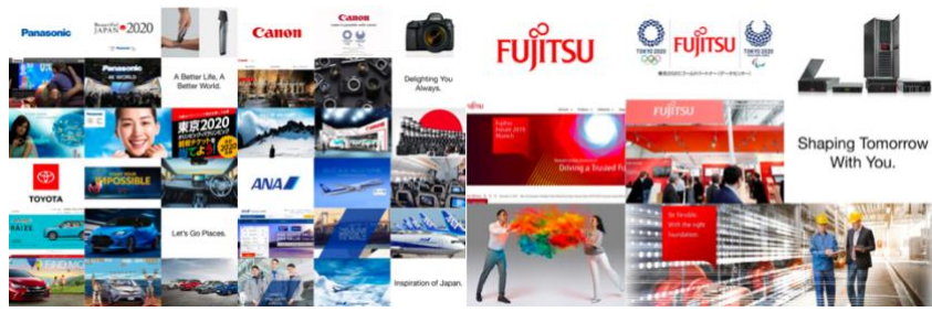
Figure 2: Collages of 5 selected companies

(1) During my class in 2019, team of six exchange students created 5 collages to represent brands. The results confirmed the hypothesis that there would be differences in brand personality between the brand represented by collages and the brand's logo.