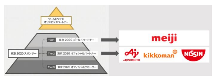
Figure 6: Meiji is from the Gold Partner tier, other three companies from the Official Partner tier

(5) In 2020, I supervised one student researching about the brand and logo personalities of Meiji (selected from the Gold Partner tier) and Ajinomoto, Kikkoman with Nissin (selected from the Official Partner tier [2].