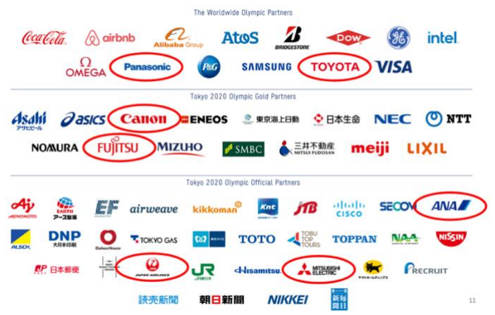
Figure 7: Selected well-known seven companies are from each tier of the sponsorship programs

The same seven internationally well-known Japanese companies were selected from each tier of the sponsorship programme: Toyota and Panasonic are from the Worldwide Top Partners, Canon and Fujitsu are from the Tokyo 2020 Olympic Gold Partners and ANA, JAL, and Mitsubishi Electric are from the Tokyo 2020 Olympic Official Partners [6].