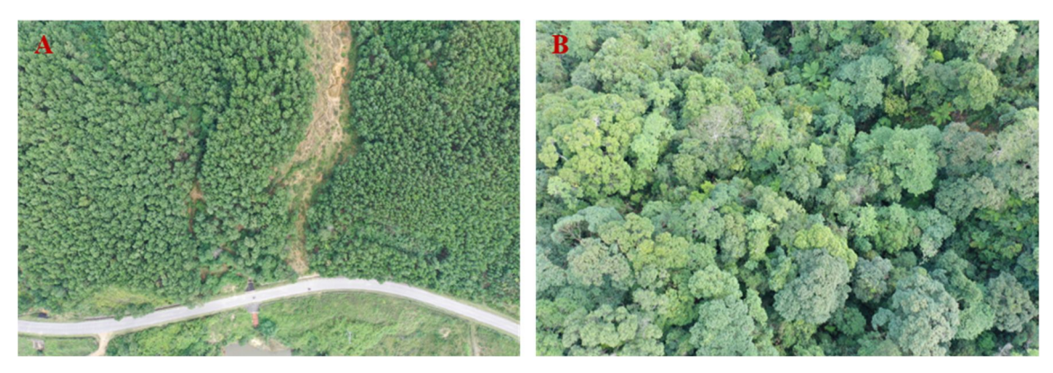
Figure 2. Drone photos of (A) monoculture plantation and (B) tropical forest in a mountainous area in Central Vietnam.

The proposed model was developed by following the principles of supervised machine learning methods. The high-resolution map layers of distribution determinants were generated by the AW3D data (the world's first 5m-resolution 3D map of the Earth), reference maps, and drone mapping (Figure 2). Those map layers were divided into training and validation data with a consideration of the community-based mapping and field survey data. Several powerful machine learning methods were tested to find the most accurate SDM.