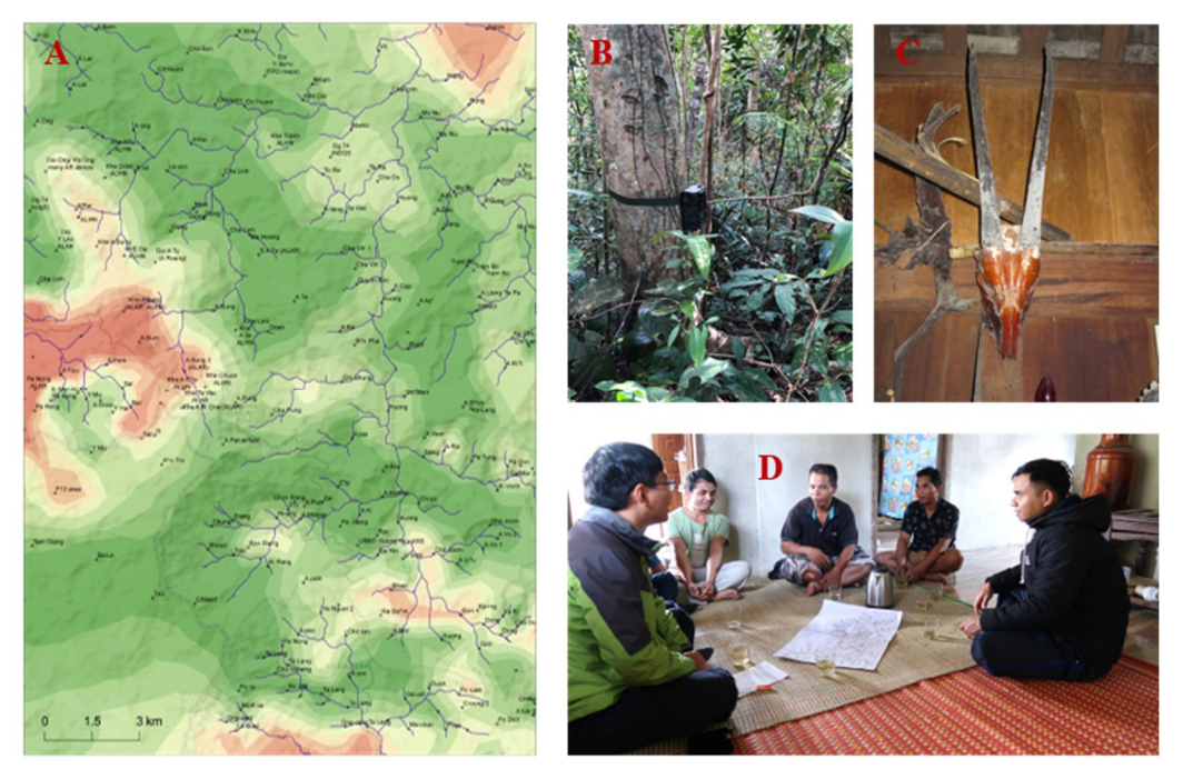
Figure 3 . (A) Prediction of the spatial distribution of the saola (potential for the distribution increases from green to red). (B) Installing camera trap, (C) a saola's head hung in a house of local people, and (D) a meeting with local people.

This research will lead to valuable insights regarding the habitat preferences of the species. Because the saola is an icon for biodiversity in the Annamite mountains, knowing exactly where it exists will attract more investments and attention to wildlife protection in the whole area. The development of the high-resolution SDM is not only useful for the conservation efforts of the saola but also could be applied to other elusive species, particularly large mammals. Therefore, the project achievements must contribute to biodiversity conservation planning and management in the world.